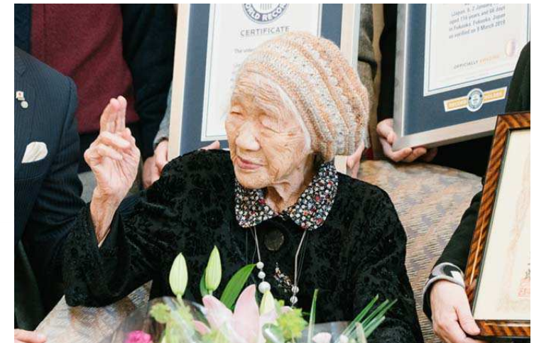
World's Oldest Person on 03/09/19

Ms Kane Tenaka – 116 years old Born 2 nd January 1903